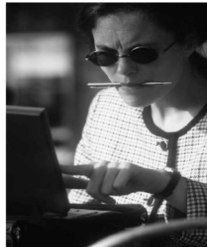
Wise Owls: No 1 for the over 45s

redesign, set for completion this Easter, programmers have ensured even greater levels of interactivity and up-to-date design. Stay tuned at www.wiseowls.co.uk !!!